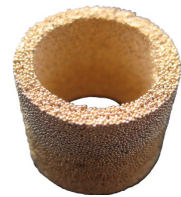
Siltex Bronze Strainer

Strainers can stop debris from passing from the chamber into the autoclaves valves, necessitating costly repairs. Regularly replacing strainers can also help prevent water fill related errors.